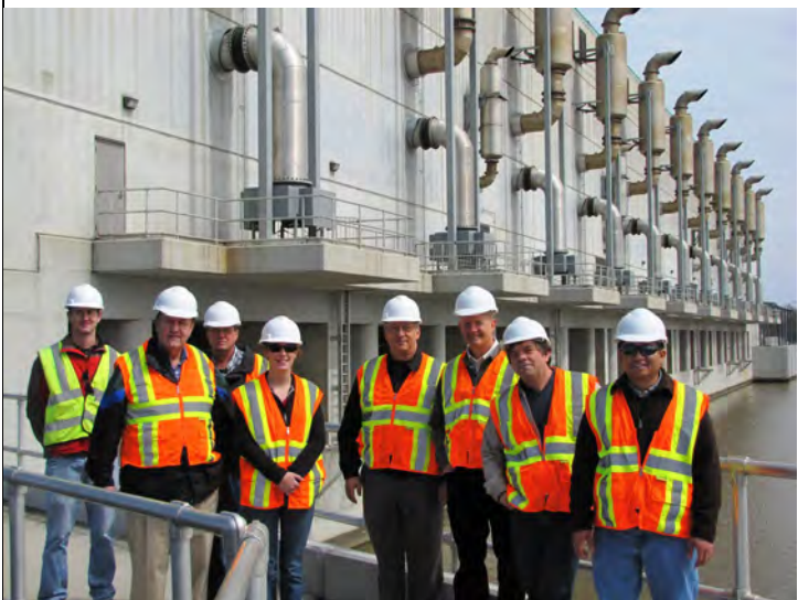
Deep South ITE members pose in front of the world's largest pumping station near Belle Chasse, LA. on March 1, 2013.

After the Technical Program and Traffic Bowl competition, DSITE members enjoyed the Social Hour held at The Bulldog in Mid City, courtesy of the ABD. On Friday morning the Business meeting was held at the RTMC, followed by a technical tour of the West Closure Complex in nearby Plaquemines Parish, part of the refurbished and expanded post-Katrina New Orleans flood protection system. The complex consists of a sector gate on the Intracoastal Waterway that can be closed to block storm surge from the Gulf of Mexico, and a pumping station that can be used to help drain the metropolitan area when the gate is closed. The pumping station is the largest of its kind in the world, with a pumping capacity of 29,000 cubic feet per second.